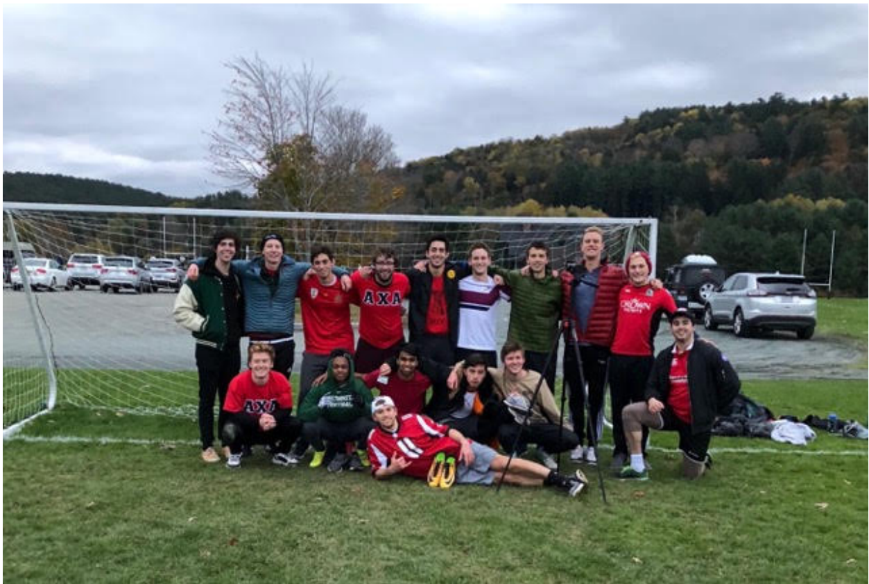
Several fearless Alpha Chi's representing our intramural soccer team on the field.