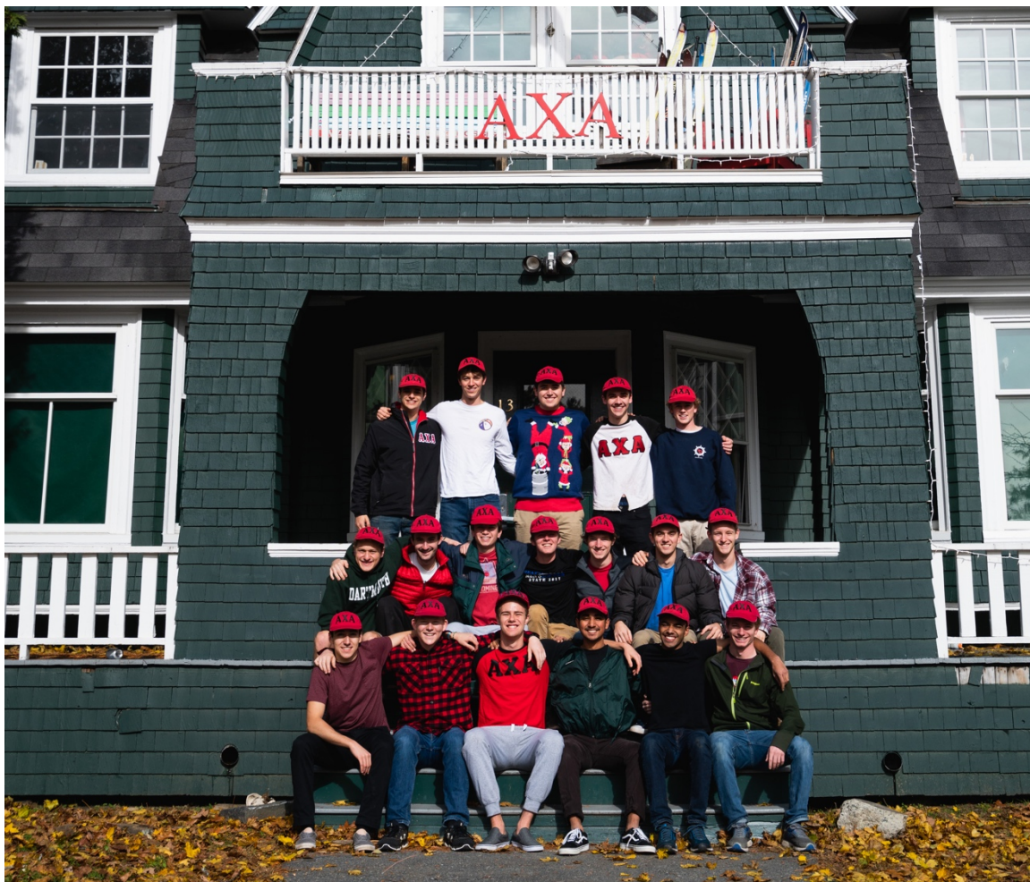
A group of our new members enjoying the end of fall term at the house!