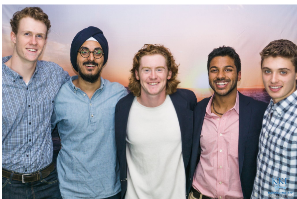
Five brothers attend Kappa Krush

Home for winter break, we're dreaming of taking shelter from the New Hampshire winter in the safety of the Alpha Chi basement.