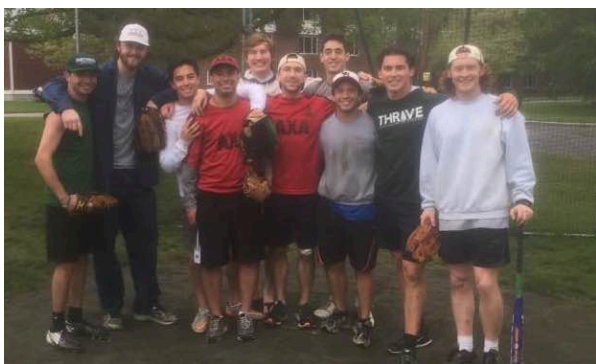
IM softball champions