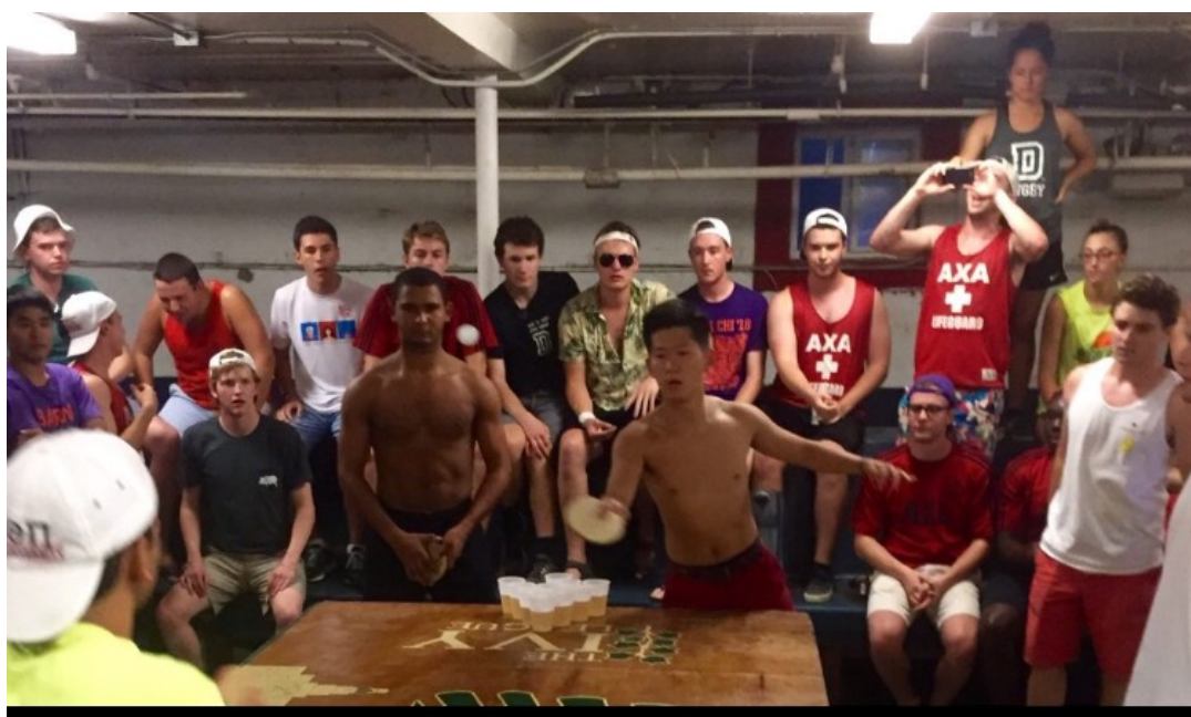
Here's to the Seniors

We love seeing and hearing from alumni, so please swing by the house if you're in town, or reach out at any time to eai.18@dartmouth.edu .